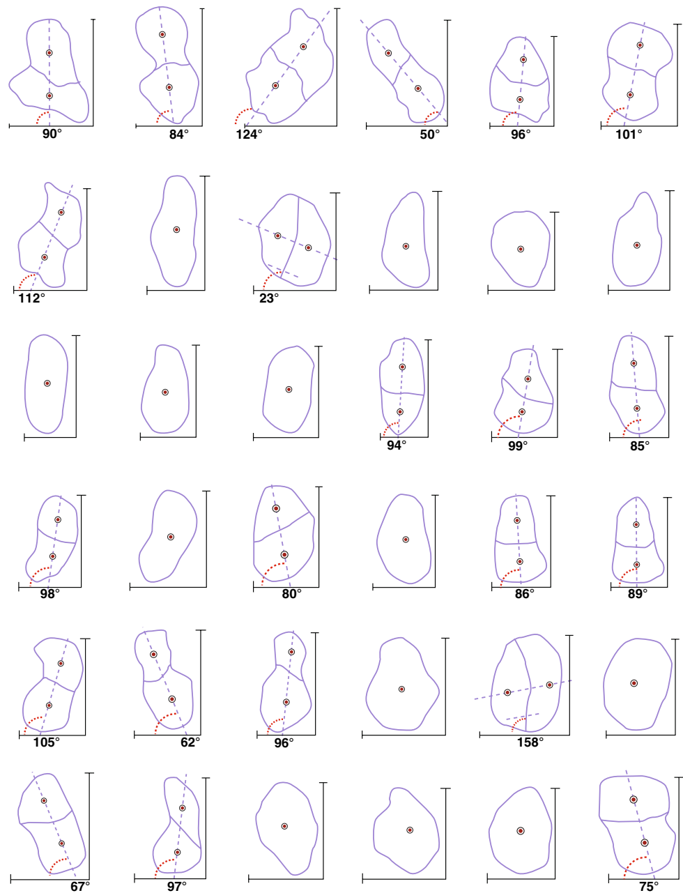
Fig. 2 AP orientation and shape of the ACL tibial footprints. Angle less than 90^\circ denotes an AM–PL orientation. Angle more than 90^\circ denotes a PL–AM orientation

we found more oval (77.8%) than triangular (22.2%) footprints. The oblique tunnel entry in ACL reconstruction results in an oval footprint as well.